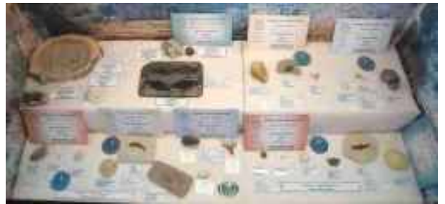
One of Barbaras displays (top left)