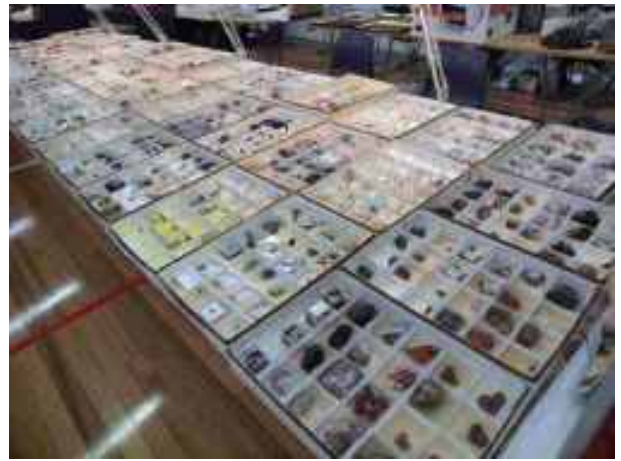
Trader - Peter Beckwith (Crystal Habit)