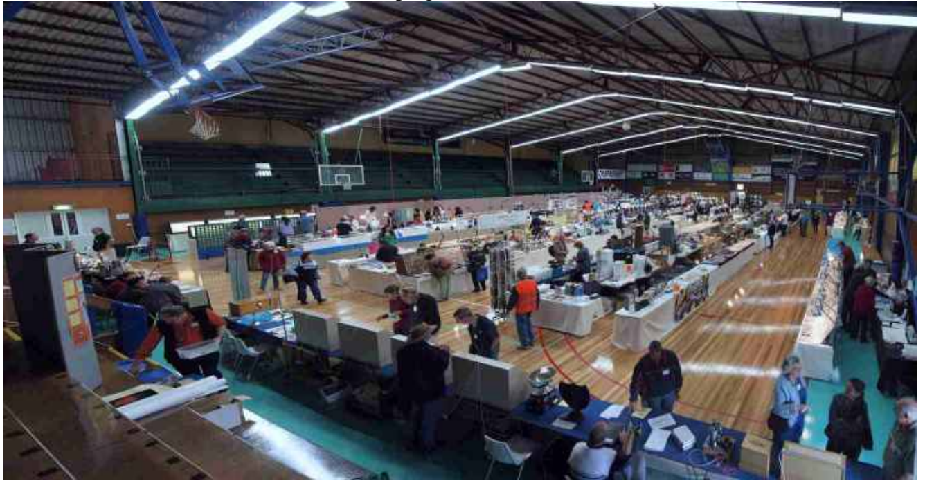
Inside the hall at the Gemboree