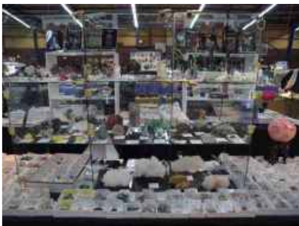
Trader - Crystal Universe